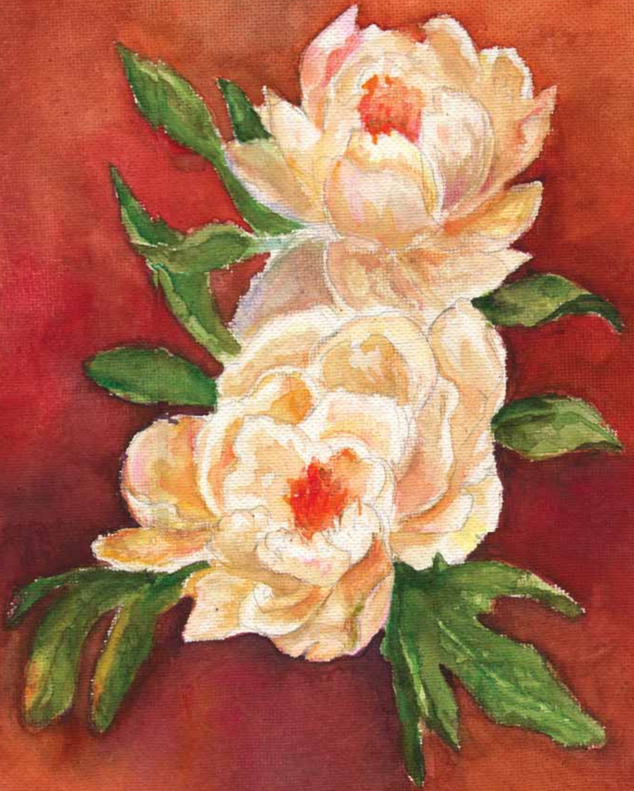
Art By: Sarbani Ghosh, A2 Level